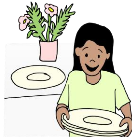
Set the Table