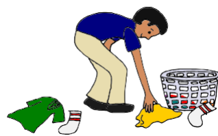
Pick Up Clothes