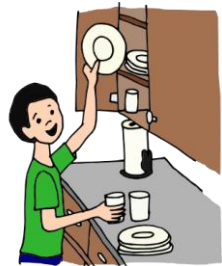
Put Dishes Away

Instructions: Cut out the dice. For stronger, longer lasting dice, stick or print onto card stock. Fold along the inside lines, and make into a cube with the flaps on the inside. Glue or tape together to secure.