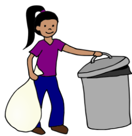
Take Out Trash