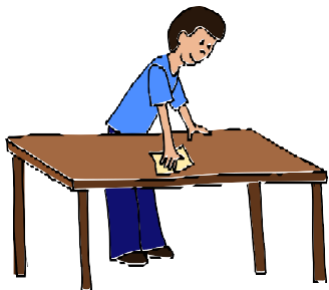
Wash the Table