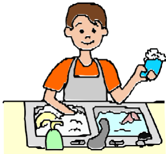
Wash the Dishes

Instructions: Cut out the dice. For stronger, longer lasting dice, stick or print onto card stock. Fold along the inside lines, and make into a cube with the flaps on the inside. Glue or tape together to secure.