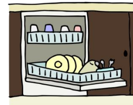
Load the Dishwasher