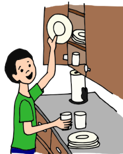
Put Dishes Away